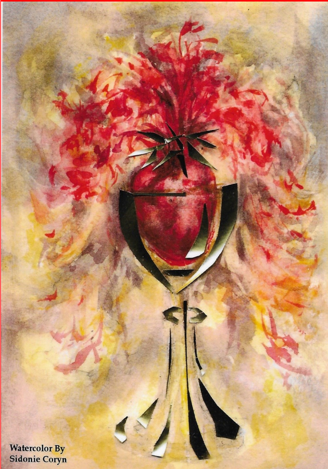
Watercolor By Sidonie Coryn