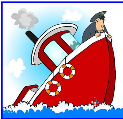
“the S.S. Fr. Randy”